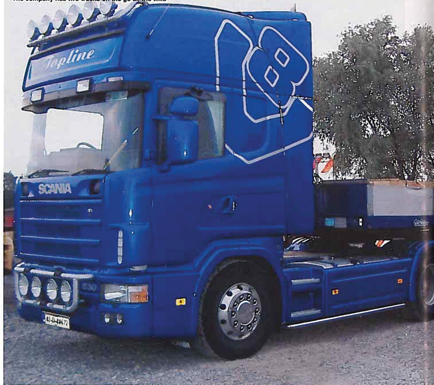
The company has two trucks on the go all the time